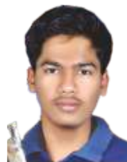
Om Khati VJTI - MUMBAI